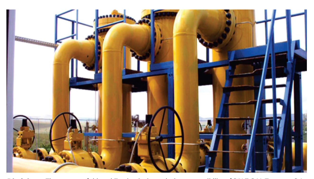
<u>Disclaimer</u>: The content of this publication is the exclusive responsibility of S.N.T.G.N. Transgaz S.A. and does not necessarily reflect the opinion of the European Union.

Reference number in the second PCI list: 6.24.8.)